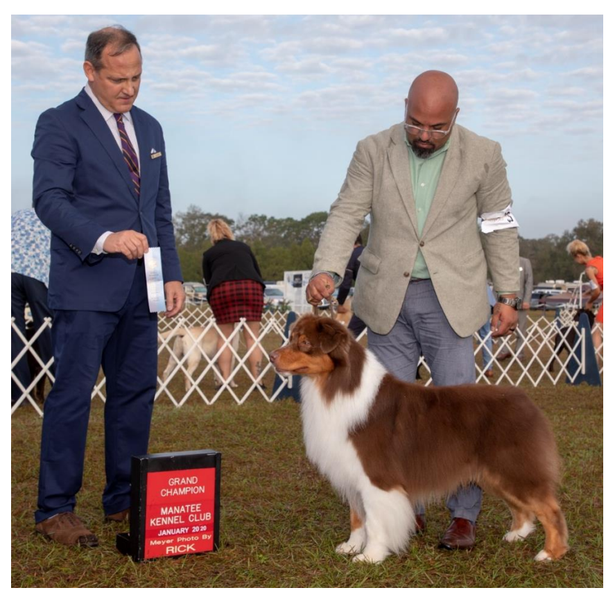
GCH CH Bayouland's Sangre De Cristo De Petaybe's Grand Championship.