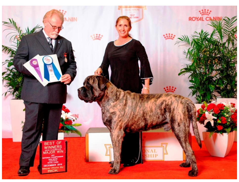
Bacchus 1/WD/BW for a 3 point major and also received an Award of Excellence at the AKC National Championship