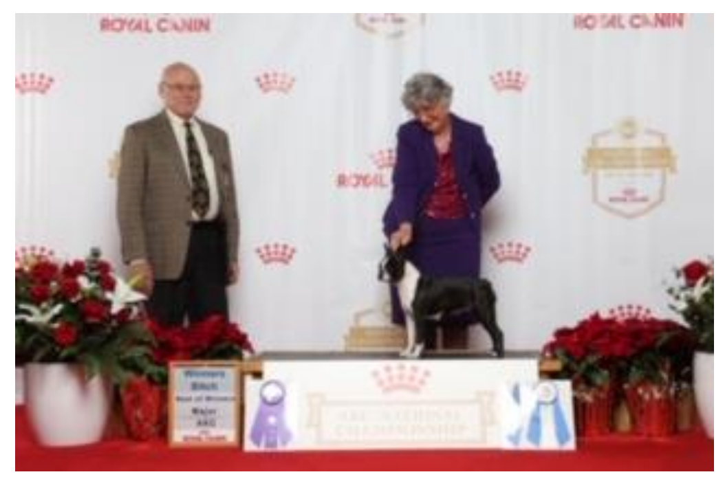
Oh, I have a big brag. My Boston "Poppy" took 3 five point majors one of them being our specialty and Best of winners on them. There were 56 Bostons entered. I'm still on cloud nine.