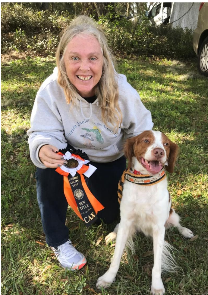
Buddah got his CAX Title BUDDAH' S BRAVEHEART WILDTHING RA,FDC,CAX,FCAT2 SCN,SIN,SBN,RATN,CGCA,CGCU,TKA